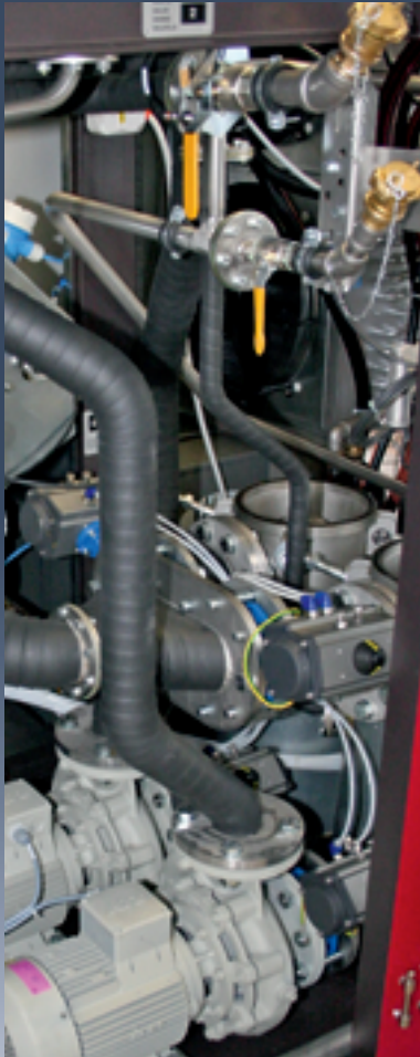
Picture above: tidy technology clearly arranged saves time and money in cases of maintenance and service.